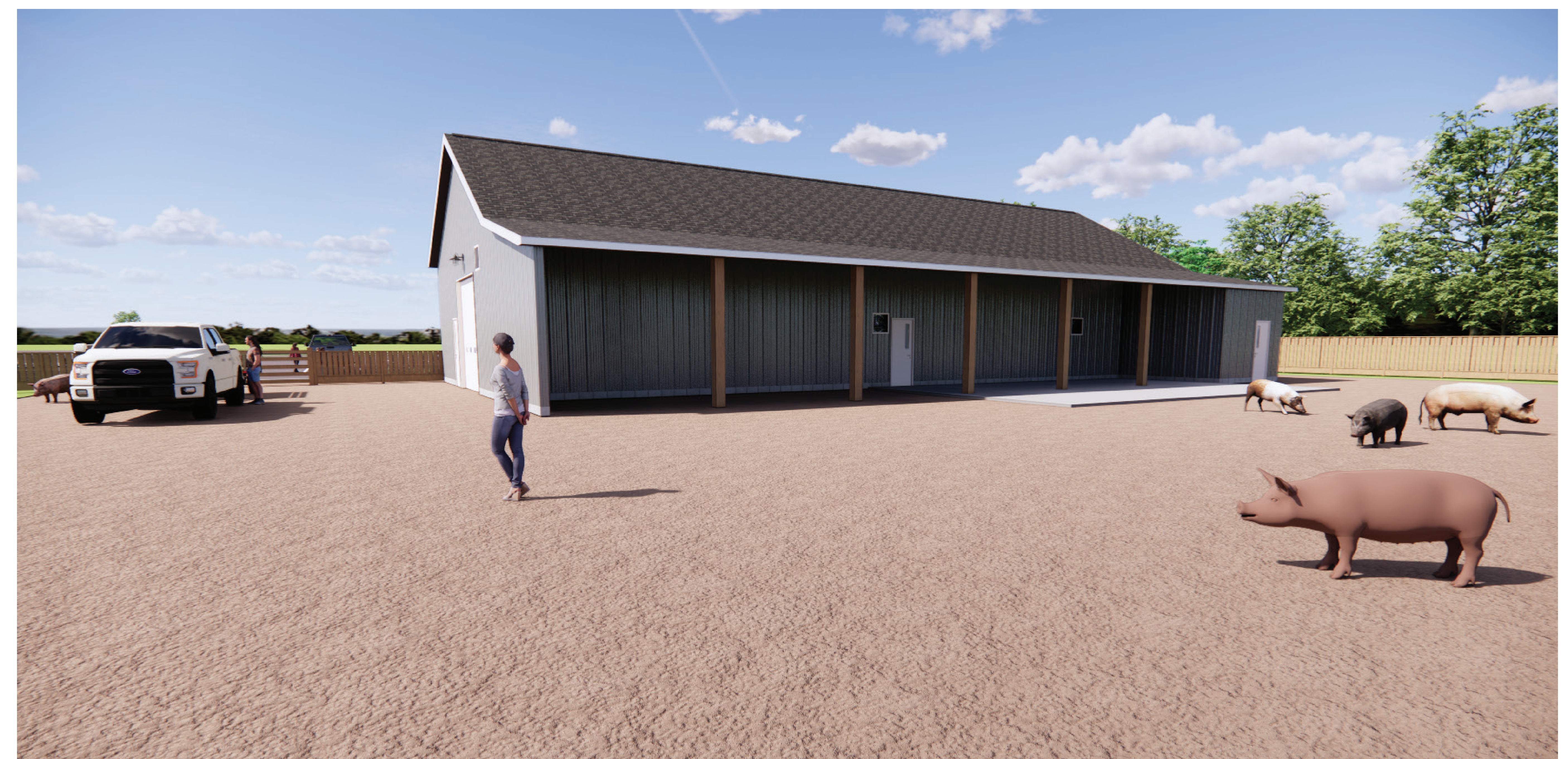
Conceptual Renderings of the New Agricultural Center